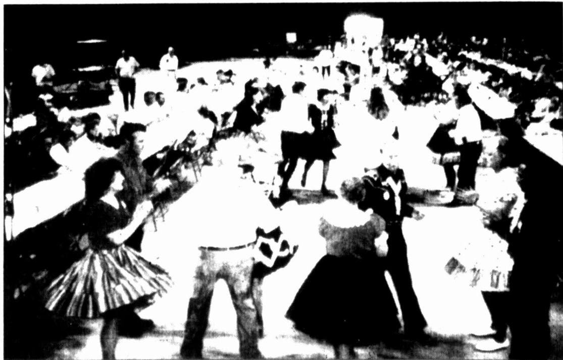
More than 300 square and round dancers from all over Texas will be converging this weekend for the 40th annual conclave. It all gets started with registration and hospitality from 1 until 5 p.m. Friday at the Best Western Motor Lodge located at 700 W. Interstate 20. Activities continue through Sunday morning.