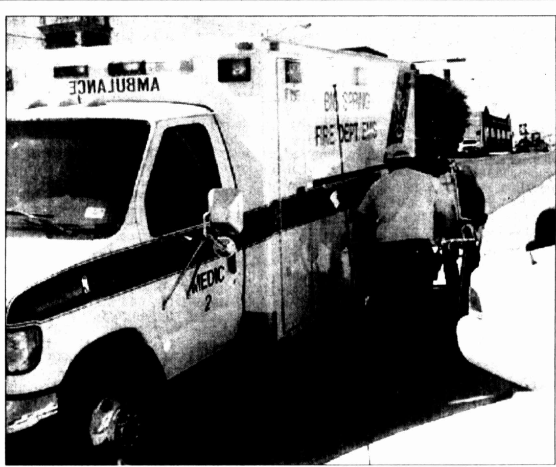
Emergency Medical Services personnel assist a Howard County jailer to an ambulance this morning. He was one of four jailers injured in an altercation with a prisoner.