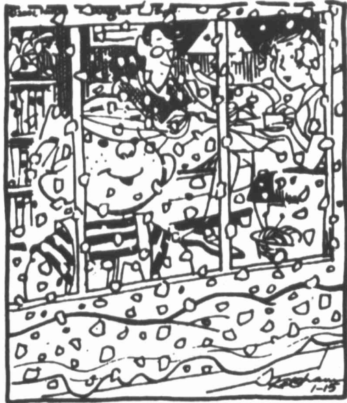
"Wow! Look at it snow! Doesn't it make you wanna go outside and play?"