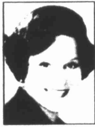
ABIGAIL VAN BUREN