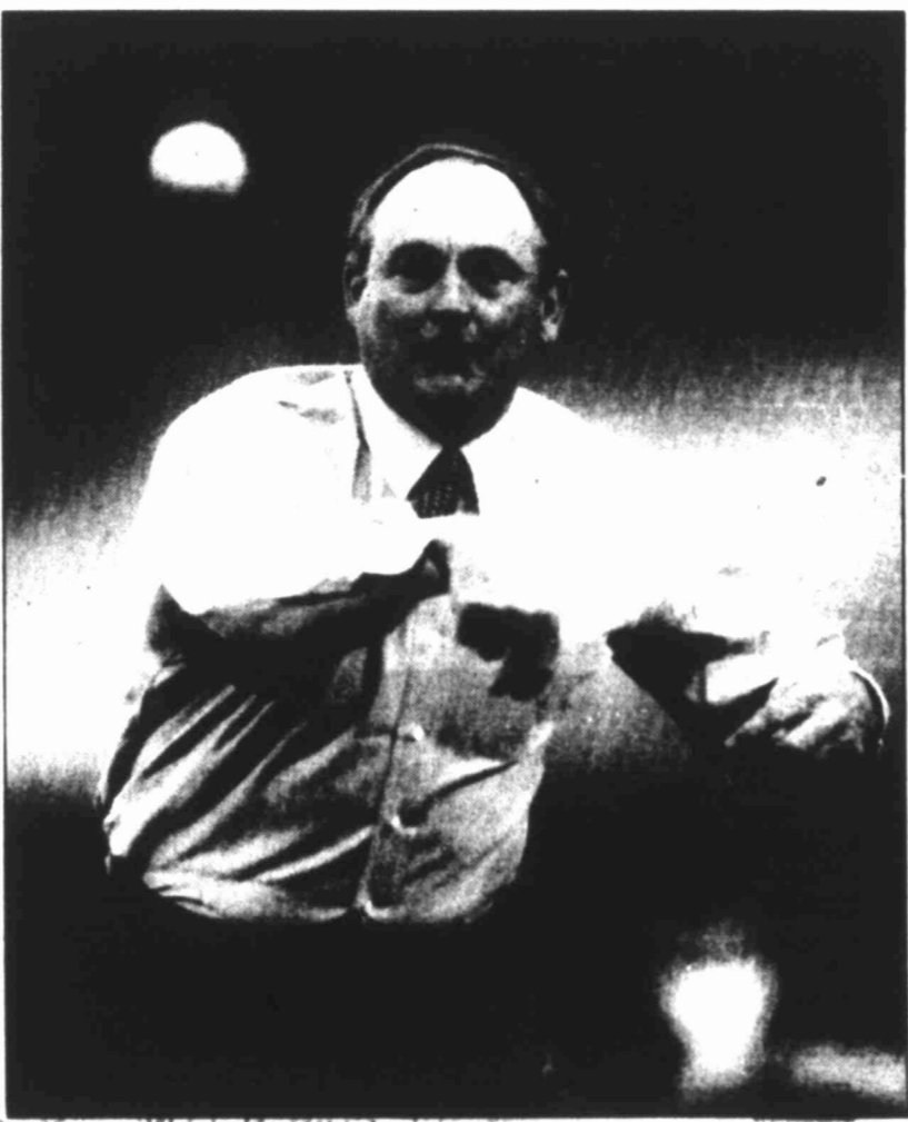
Hall of Fame pitcher Nolan Ryan, pictured here throwing the first pitch at the 66th All-Star Game in 1995, was listed in stable condition this morning after having undergone emergency double-bypass surgery on Sunday.