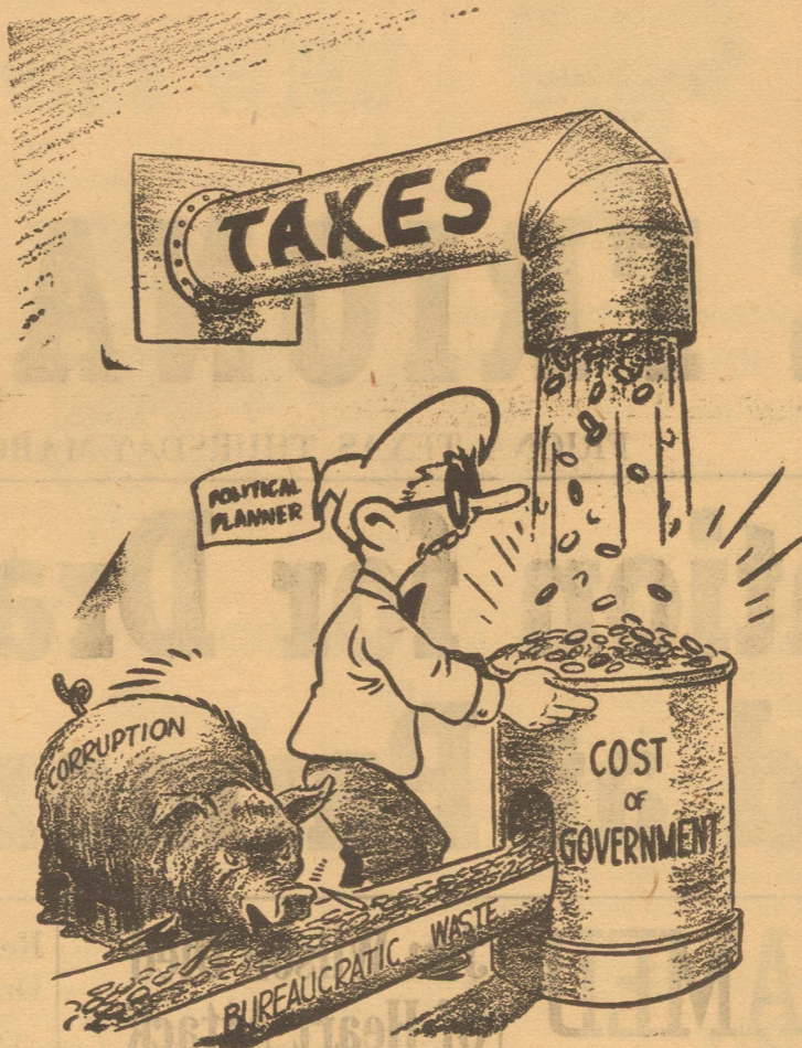
Pigs Will Be Pigs