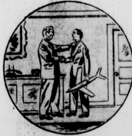
"Our willingness to invest."