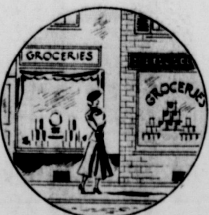
"Free Markets and competition."