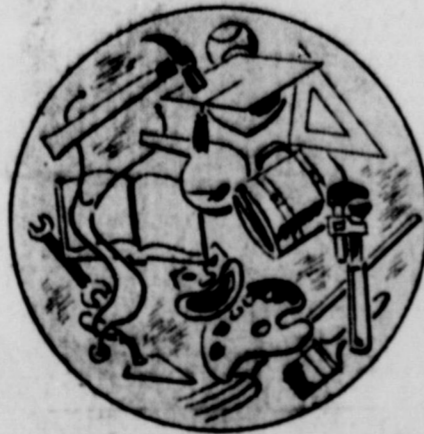
"Our right to choose."