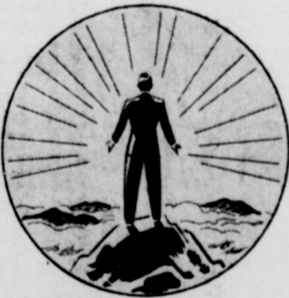
"REWARD for initiative."