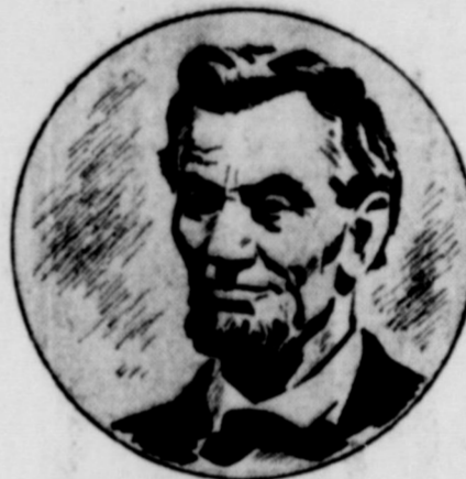
"Free government—of the people—by the people—for the people."