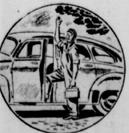
"Labor's right to organize and bargain."

FREE Send for this valuable booklet today!