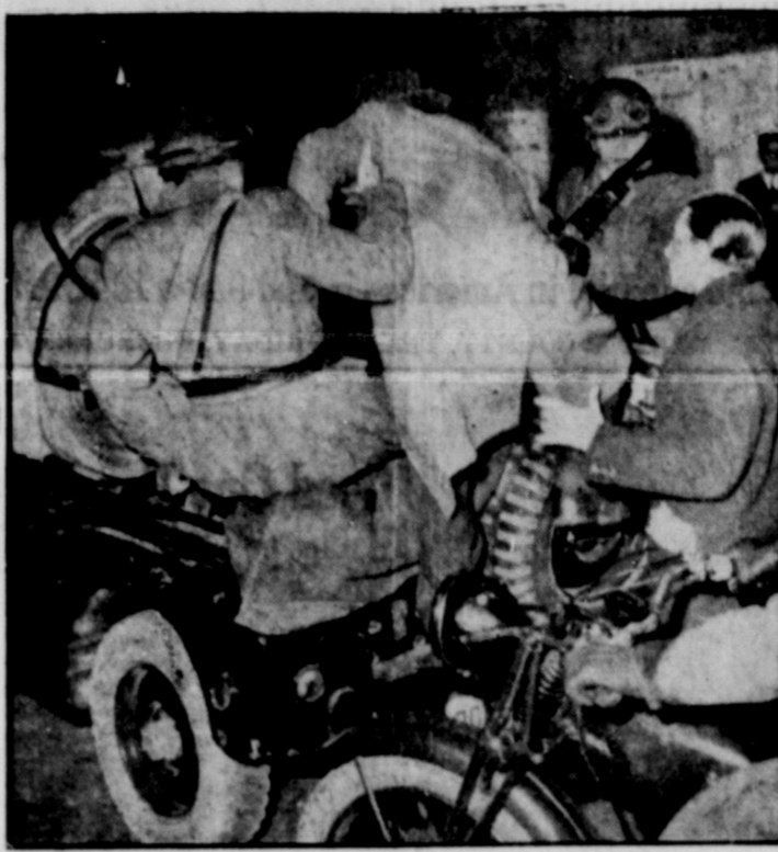
RED DEMONSTRATOR ARRESTED—Motorized riot police in Rome arrest a Communist demonstrator in the downtown section after Reds tried to march through the city in an unauthorized procession.