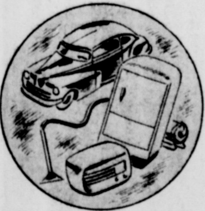
"More goods of better quality at lower costs, paying higher wages."