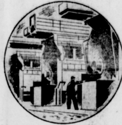
"Sound use of machine power."