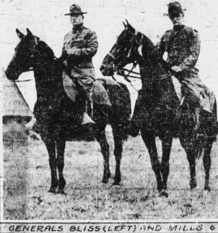
GENERALS BLISS (LEFT) AND MILLS

shooting at the lamps. A roaring wind carries the flames to the rest of the wooden structures of the town and it is wiped out in a spectacular blaze.