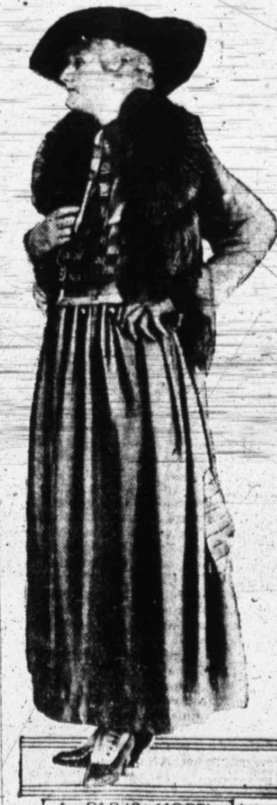
A PARIS MODEL

HALTON & FRIEDLY'S 614 8th St. OPTICAL PARLOR