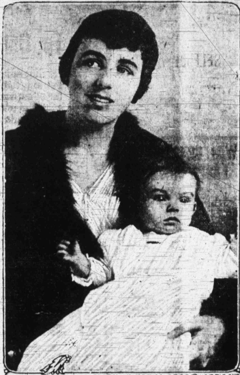
MRS. McADOO AND ELLEN WILSON McADOO. Mrs. McAdoo, who was married to Mr. McAdoo, who was a widower on May 7, 1914. Little Miss McAdoo is six months old.