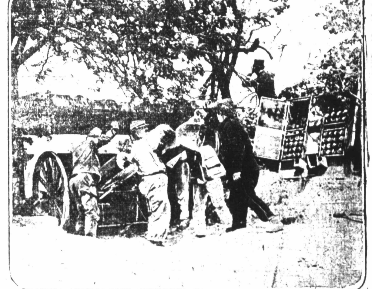
FRENCH GUN FIRING DOWN INTO PASS

When the time comes, say the French, General Joffre will then reports of artillery fire and the throwing of grenades make up the greater part of the news from the west front. Says one official announcement: "The artillery actions have been very spirited in Artois, around Loos and Hilluch as well as to the north of the Senné and to the north of the Aisne, in the region of Arrancourt, Dancourt and Thillois and also near Soissons. The enemy works were very badly damaged by our fire. The picture shows the firing of a French piece into a pass in Alsace."