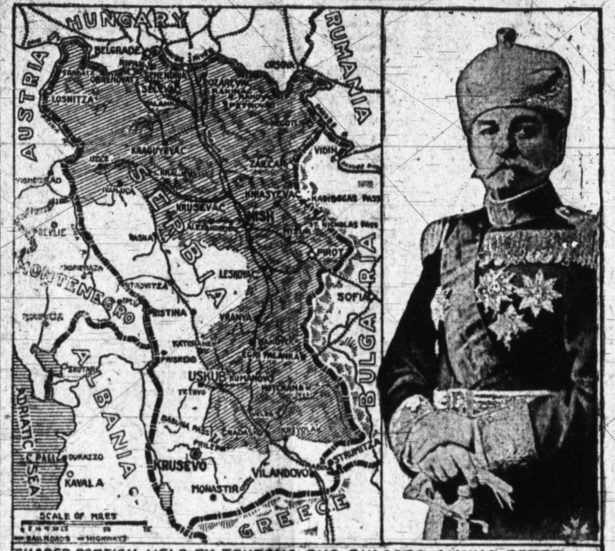
SHADED PORTION HELD BY TEUTONS AND BULGARS & KING PETER

Owing to the rapid advance of the Teutons from the north and northwest and the Bulgarians from the north and northeast, vainly opposed by the Serbians, most of Serbia, both old Serbia, as it was constituted before the first and second Balkan wars, and new Serbia, as it was enlarged at the expense of Turkey, is now held by the invading enemy.