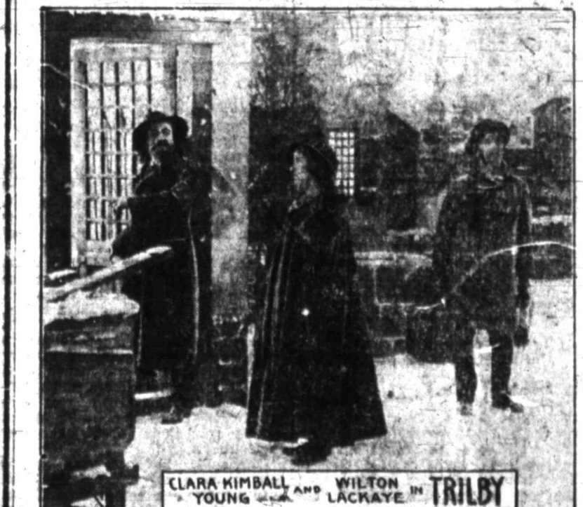
Scene from "TRILBY" at the Majestic Tuesday—Clara Kimball Young is starred.

When school dismissed this afternoon, the pupils were free from the cares of study until Monday morning, being given both Thursday and Friday as holidays. It has always been found difficult to hold satisfactory classes on the Friday following Thanksgiving, and in most cities that day has also been made a holiday, giving the young folks three days after Thanksgiving in which to recover from the effects of too much turkey, football and other Thanksgiving excesses.