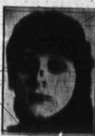
THEBA BARA "BIBI" A Fox Masterpiece.