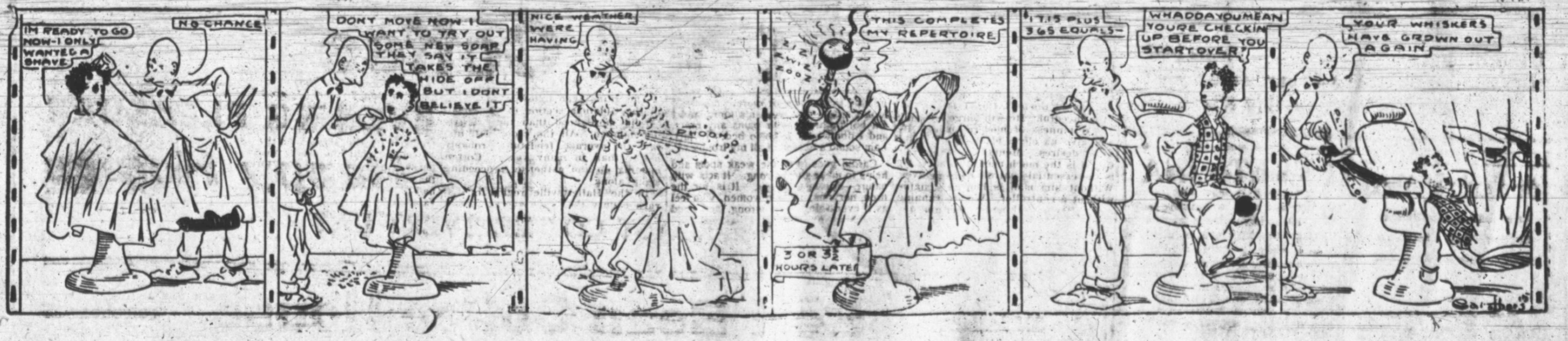
CHARLIE CHAPLIN'S FUNNY CAPERS He'll Get Away When The Shop Closes