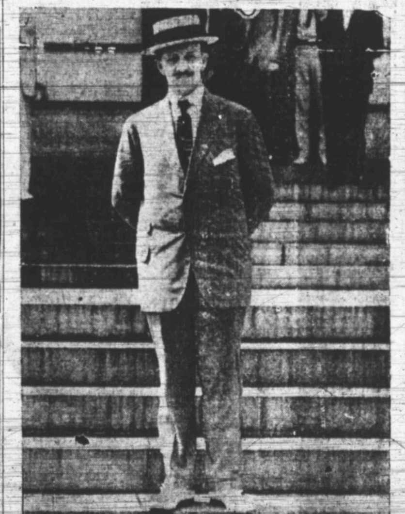
COUNT VON BERNSTORFF ON STATE DEPARTMENT STEPS

Count von Bernstorff, the German ambassador, has been exerting all of his diplomatic skill in an attempt to satisfy the United States on the latest submarine issue and thereby to make possible the continuation of diplomatic relations between Washington and Berlin. Secretary Lansing and Count von Bernstorff declined to discuss the details of the conference which have been carried on at the state department. After one of these conferences the ambassador sent a long message to Berlin, telling of the conference and intimating to the foreign office that its note on the Arabic was altogether unsatisfactory to the United States. Count von Bernstorff also advised his foreign office that the United States is altogether serious in the Arabic case, and that unless satisfactory amendments are made without further delay President Wilson's patience will become ex-