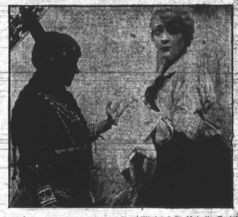
Scene from the Fox Feature, "Life's Shop Window," at Majestic Tonight

LIQUID ARUON For removing dandruff— Price $1.00 The Bottle Palace Drug Store Try Times Want Ads