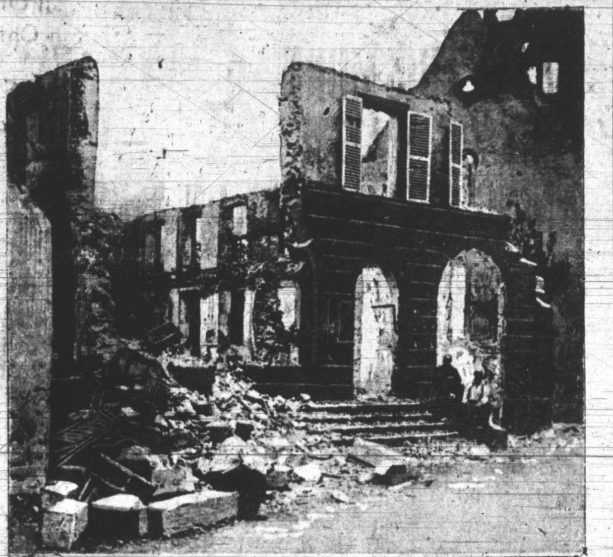
RUINS OF MAYOR'S HOUSE AT ASPACH LE HAUT

The accompanying illustration, taken less than a month ago in Alsace-Lorraine, gives an idea of the damage wrought by shell fire in the European war.