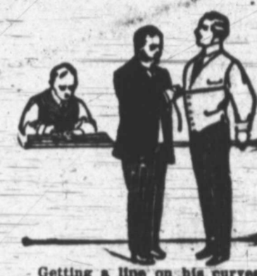
Getting a line on his curves