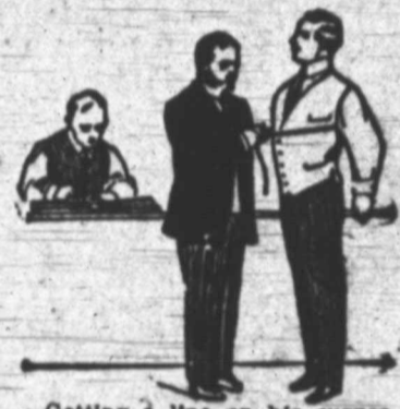
Getting a line on his curves

Collier Tailoring Co. Cleaning and Repairing 717 - 7th Phone 732