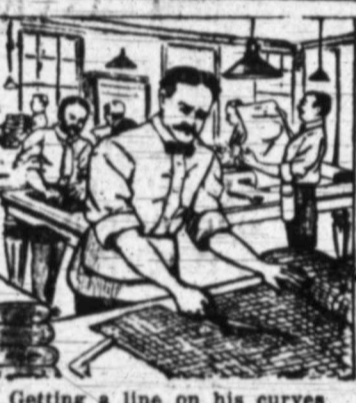
Getting a line on his curves

Have your suit made to measure. How about that spring suit? We will fit you if you give us a trial. Popular priced tailors. Collier Tailoring Co. 717 - 7 st Phone 732