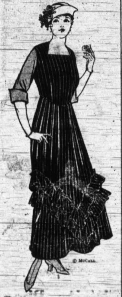
The New Basque Waist and Full Skirt

New York, March 24.—The buyers have returned from Paris. Almost all the Parisian dressmakers held their openings, and the buyers bought their models and hurried them to the steamers to get them well on their way before the maritime blockade should be enforced.