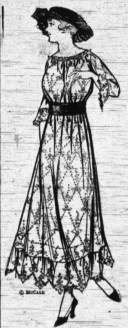
Embroidered Crepe Accentuates the Beauty of Simple Lines

quality, but the covert is indeed a new departure and beautiful in its texture. A new satin called Georgette satin from its originator is being used a great deal for hats. It is a coarsely woven satin, and comes in black, tan and mulberry, with ribbons to match.