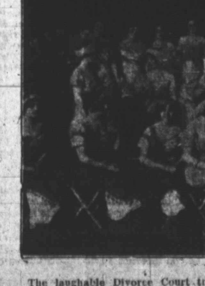
The laughable Divorce Court travesty in the merry musical comedy, "A Modern Eve" at the Wichita Theatre, Saturday, February 6.