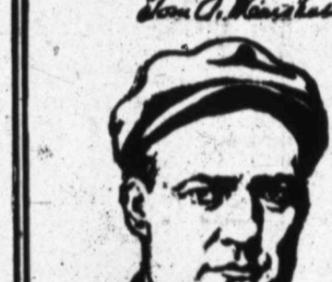
FRED GILBERT, the celebrated trapshooter

"Tuxedo tobacco is unquestionably the acme of perfection; smoking Tuxedo makes life better worth living."