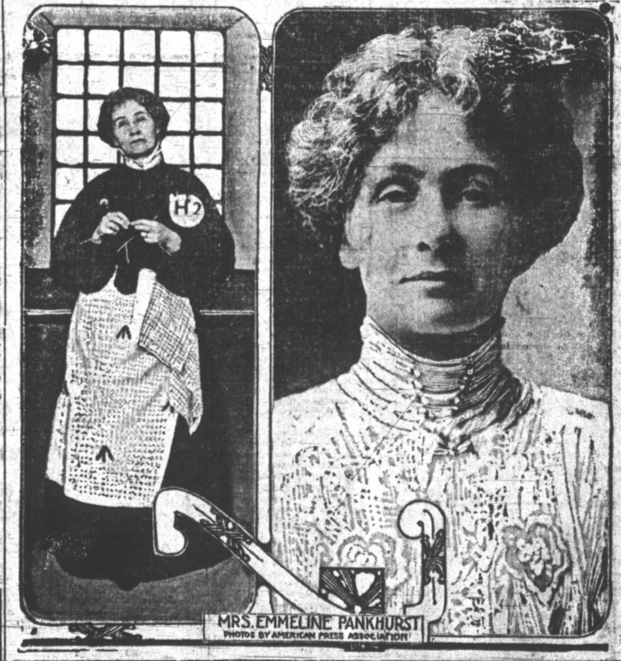
MRS. EMMELINE PANKHURST.

YOUR VACATION. This summer will not be enjoyed unless you have THE TIMES follow you. You will enjoy your trip much more if you keep up with the affairs at home. Remember the address may be changed as often as desired without extra charge.