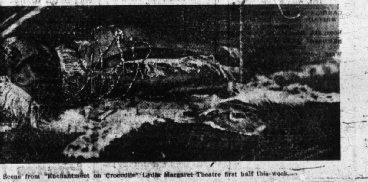
Scene from "Enchantment on Crocodile" Lydie Margaret Theatre first half this week.