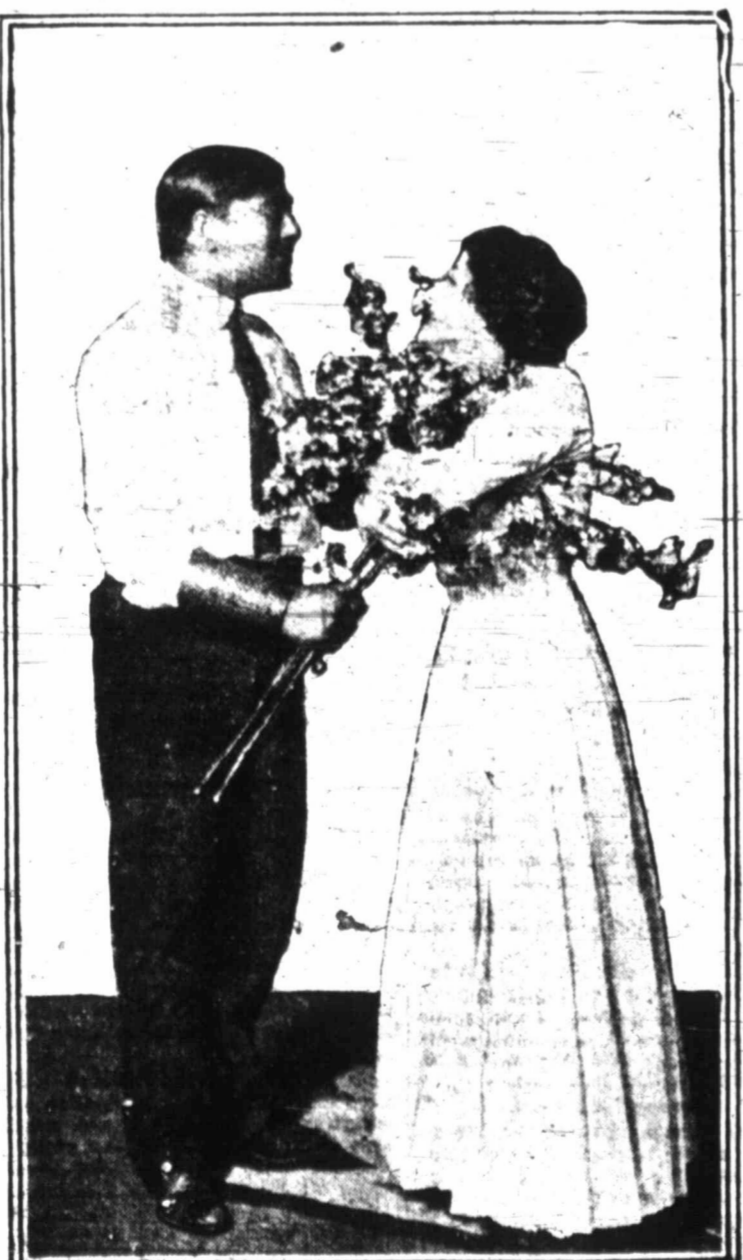
Scene from the Girl and the Stampede, at Wichita Theatre April 29.

MISSIONARY DAY OBSERVED BY FOURTH STREET BAPTISTS Sunday was observed as Missionary Day at the Fourth Street Baptist Mission. Sunday school and the morning church service, being merged into one. A special missionary program had been arranged and was carried out. It consisted of songs and recitations, the special music being unusual in good. A large number were in attendance.