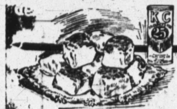
K C Baking Powder Biscuits

Baking Powder Biscuits made by this recipe are so far ahead of ordinary baking powder biscuits that, if once tried, you will never use any other recipe. Try it the next time you run short of bread. Save this recipe. 29