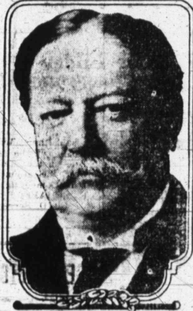
WILLIAM H. TAFT William Howard Taft

When the youth's father died he left his extensive interests to his widow, who is worth several millions. Each morning he arises early and goes to work in the factory to learn the business, with an idea of some day succeeding his father in its management. He is studying the work of every department and does overalls and works as hard as any of the other employes.