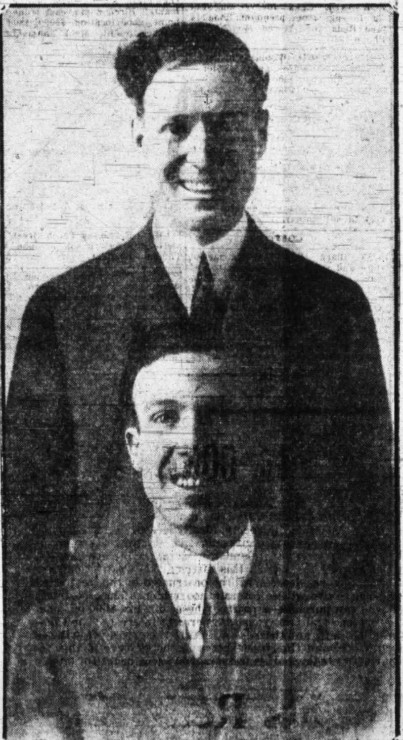
CPENING AT THE LYDIA MARGARET TODAY.

dam and spillway. Where he will go charity patients. Wichtla Falls Un-