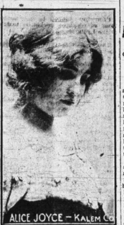
ALICE JOYCE - KALEM CO.