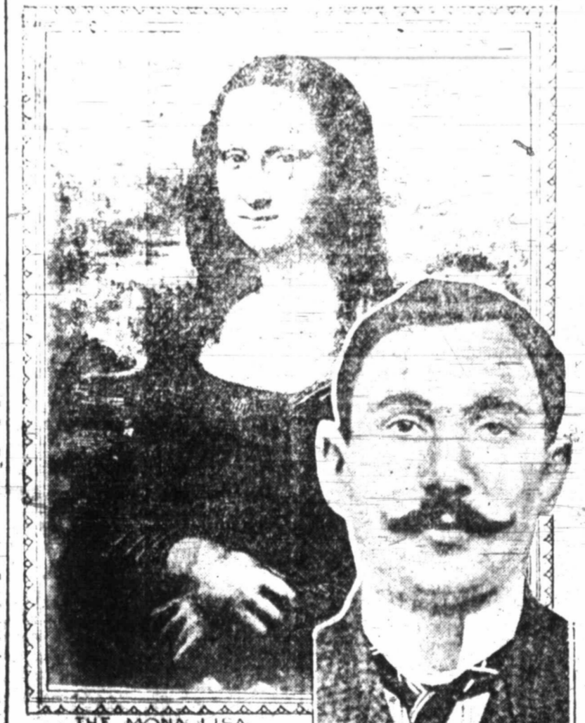
THE MONA LISA

Florence, Italy, Feb. 22.—International interest centers in the trial of Vincenzo Perugia, the Italian painter who was arrested here a few months ago on a charge of stealing the famous Leonardo da Vinci painting "Mona Lisa." He confessed he stole the canvas from the Louvre in Paris. The theft of the "Mona Lisa" was an international mystery for over two years. Finally the painting was found in the squalid quarters occupied by Perugia.