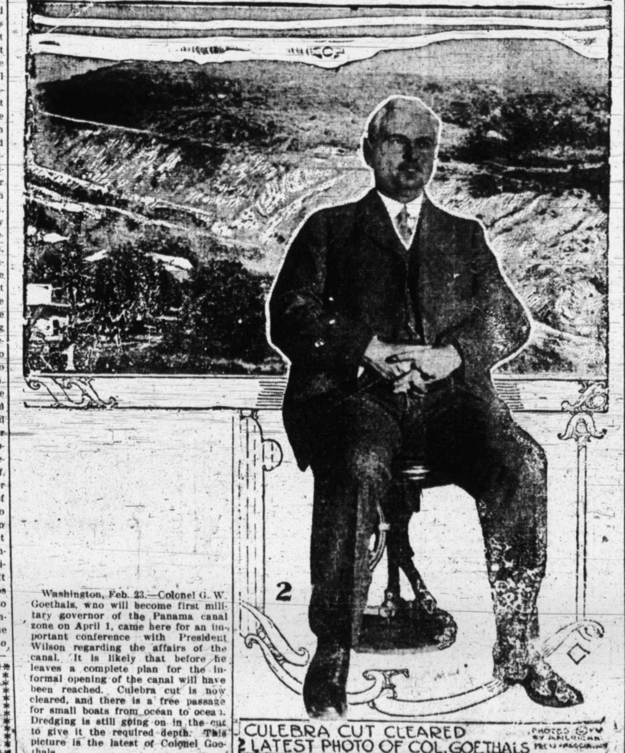
Washington, Feb. 23.—Colonel G. W. Goethals, who will become first military governor of the Panama canal zone on April 1, came here for an important conference with President Wilson regarding the affairs of the canal. It is likely that before he leaves a complete plan for the informal opening of the canal will have been reached. Culebra cut is now cleared, and there is a free passage for small boats from ocean to ocean. Dredging is still going on in the cut to give it the required depth. This picture is the latest of Colonel Goethals.