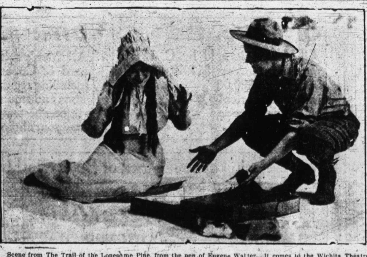
Scene from The Trail of the Lonesome Pine, from the pen of Eugene Walter, It comes to the Wichita Theatre Wednesday night, January 14.