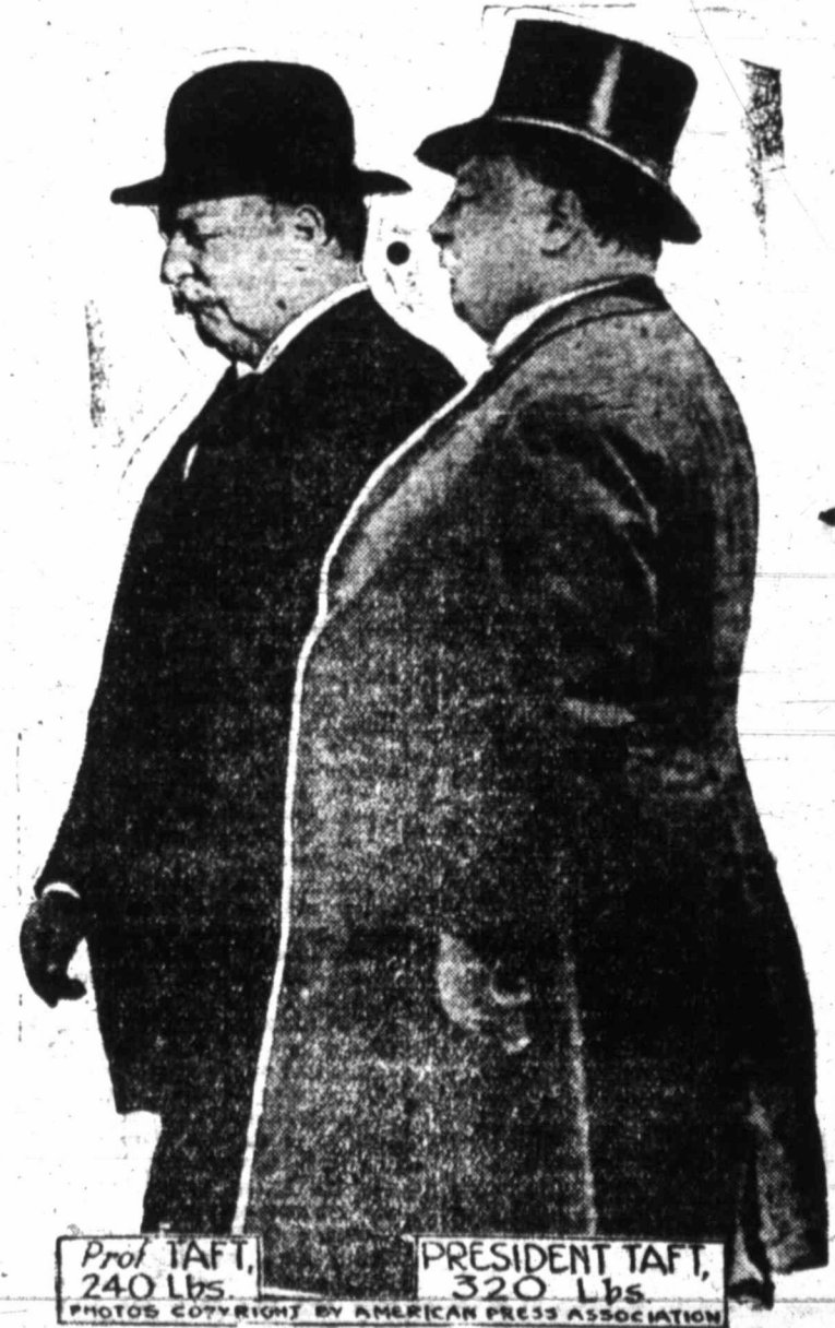
Observing persons who made mental measurements of William Howard Taft, until six months ago president of the United States, at the open golf championship games in Brookline, Mass., had occasion to revise all their previous ideas and look twice to see if it was really Mr. Taft. The former president has lost a good part of his once monumental proportions. The earth which once sagged under his 320 pounds now smilingly carries his reduced weight. Still portly and comfortable, Mr. Taft is no longer in the class of fat men. To speak in terms of avoirdupois, he now weighs about 240 as against his former 320. For six months every morning after a brisk ride in the saddle of his faithful hollow backed horse Mr. Taft has sat down to breakfast made up of such illusory trifles as one egg, a slice of toast and a cup of unsugared coffee.