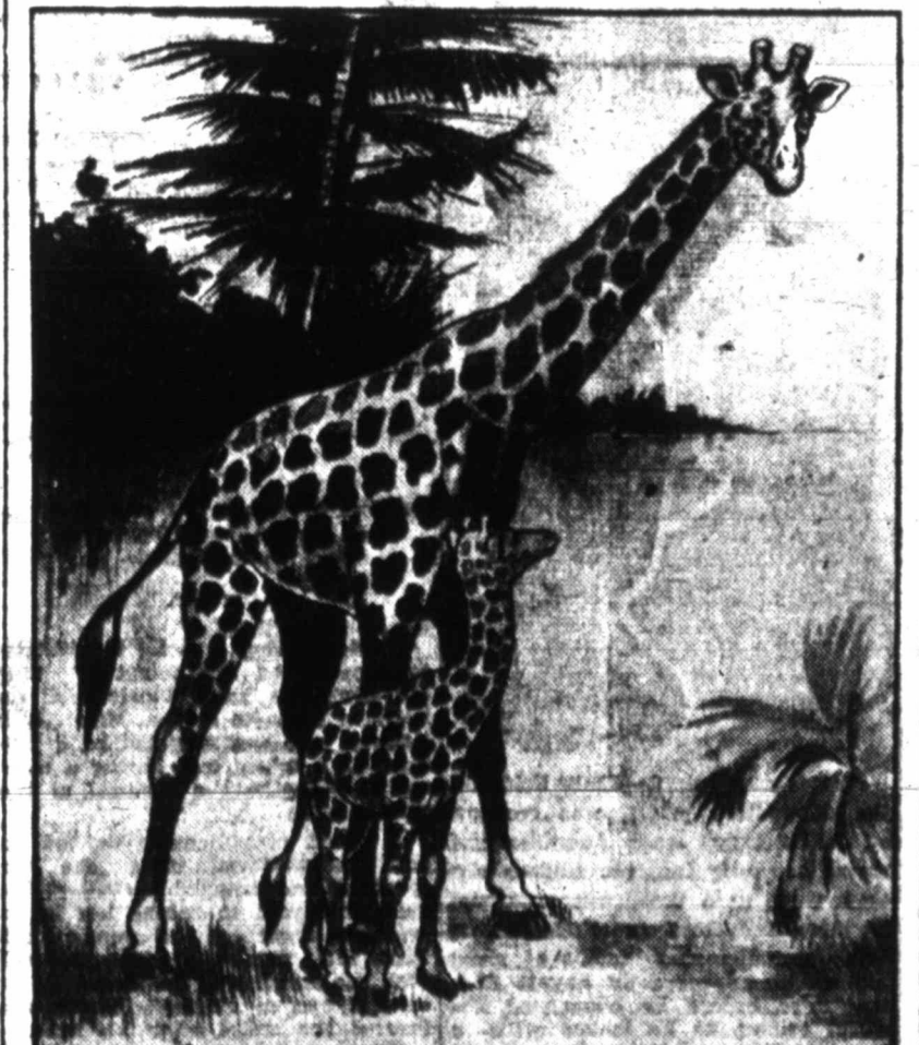
Mother and Baby Giraffes with Ringling Bros. Menagerie. Coming Wednesday, October 15th.

Sulzer an Actor. He swung on his heels and his long forefinger fairly stabbed the air as he histrionically picked out in their seats in the senate the men he accuses. "And if I am forbidden the right to speak I shall appeal to the people this very night your honor," he declared. "I have here in my pocket proofs—" That appeal to the people will have weight, too. "One reason why I am being legally lynched is because I have kept the faith," he said. "I tried to give the people of New York the primary law the Democratic party had promised, but which the bosses would never grant. From their point of view they were right. Even with the abortive primary law we now have on the statute books—a law bad from every point of view—I have defeated every upstate leader in the primaries." "But the real reason is that I have been after the grafters. I have secured the indictment of nineteen grafters in the prison scandals, and shown that $17,000,000 were stolen by the highway thieves in twenty-two counties alone. When they saw that I could not be handled—one of the biggest men in New York said where you sit now, and tried to bribe me. They offered me everything—money, political power. Then they tried to frighten me. And when they could not, the grafters went to Murphy. 'Now,' they said, at the meeting in Helms' parlors, 'you must stop him. We have failed.'" "And this impeachment trial is the result. If Murphy had the power he would hang me for the crime of wearing a slouch hat."