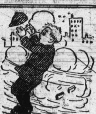
Perfection Feet took in Chicago. The Wind there blew and blew it damaged everything in sight Except Feet's Clothing now.

1914 35 HP. 114 Inch Wheel Base Overland Model 79 $950 F. O. B. TOLEDO Wichita Overland Company, w. s. Willis, Mgr.