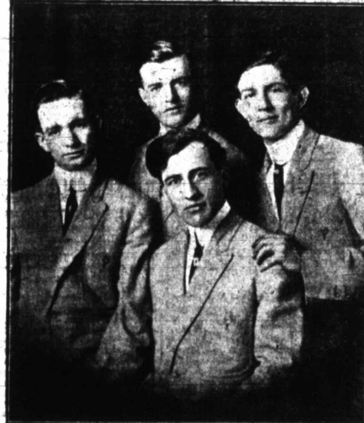
Monarch Comedy Four in a little bit of everything, now playing at Lamar Airframe, for the first half this week.