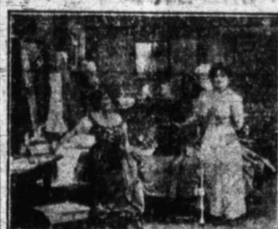
Mrs. Fiske in "Tess of the D'Urbervilles" at Lydia Margaret Theatre to night.