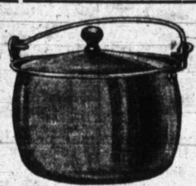
Our large stock of Pure Aluminumware on sale at Twenty Per Cent Off