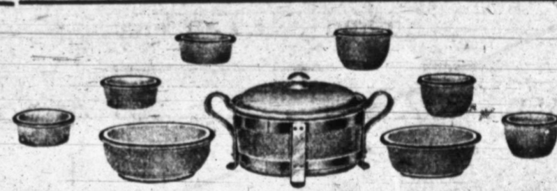
The above nine-piece set worth $3.50, sale price $2.50. All other pieces Weller and Gurnsey ware at like production

BICYCLES. We are offering our high-grade Westminster Bicycle, men's and boys'. They are cheap at $25.00, sale price only $20.00. You will have to hurry if you want one. Just received, a new line of fern dishes and jardineers on sale at 20 per cent off.