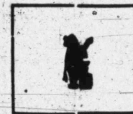
You can paint your automobile with Auto Chi-Namel.