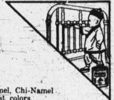
Iron Enamel, Chi-Namel in the best colors.