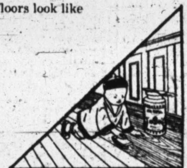
Makes the floors look like new.