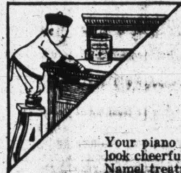
Your piano would also look cheerful with a Chi-Namel treatment.