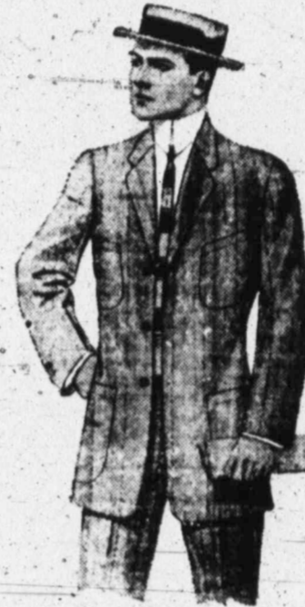
Suits ..... $15.00 to $50.00

619 Ohio Avenue A. DRAKE, Prop. General Transfer, Storage and Distributor.