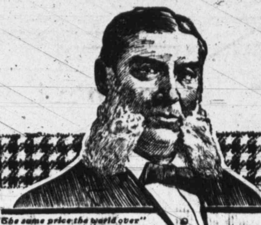
"Give some price to the world over"

W. B.—Write for Ladies' Advisory Dept., Chattanooga Medicine Co., Chattanooga, Tenn., for Special Instructions and 64-page Book, "Home Treatment for Women," sent in plain wrapper, on request. (Advertisement)