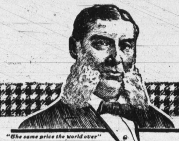
"Give same price the world over"

If you have indigestion, no matter how bad, the Rohatsch mineral water will cure you. Remember when we deliver water to you, you get a clean vessel that has been scalded and thoroughly cleaned. We use antiseptics against the spread of loathsome diseases. Our cork seals to prevent others from slobbering or drinking out of the vessel before it has been delivered to you. Remember we have a good clean tradition and are improving our plant to take care of our customers. If you want the best for health we have it. J. J. Rohatsch, Prop. Phone 1601 Ring 14.