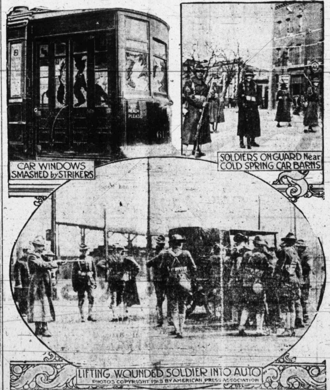
EVEN AFTER NEW YORK STATE TROOPS HAD BEGUN PATROLLING STREETS IN BUFFALO TO PROTECT STRIKEBREAKERS WHO ATTEMPTED TO MAN THE TROLLEY CARS DURING THE STRIKE OF MOTORMEN AND CONDUCTORS, STRIKERS DID THEIR BEST TO PARALYZE THE CRIPPLED SERVICE. CARS WERE STONED, WINDOWS SMASHED AND STRIKEBREAKERS PULLED OFF THE VEHICLES AND BEATEN. THESE PICTURES SHOW SOME OF THE THINGS THAT HAPPENED.

McGrattan-Millsaps Co. | McGrattan-Millsaps Co.