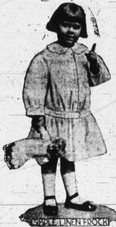
A SUMMER PLAY GOWN FOR THE LITTLE TOT.

For sanitary carpet cleaning call the Handy Man. 72 tfe