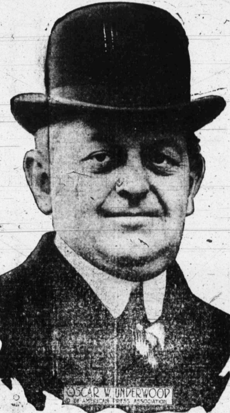
Oscar W. Underwood, chairman of the House Ways and Means committee and President Wilson are apparently in entire harmony over the new tariff bill introduced in the House yesterday.