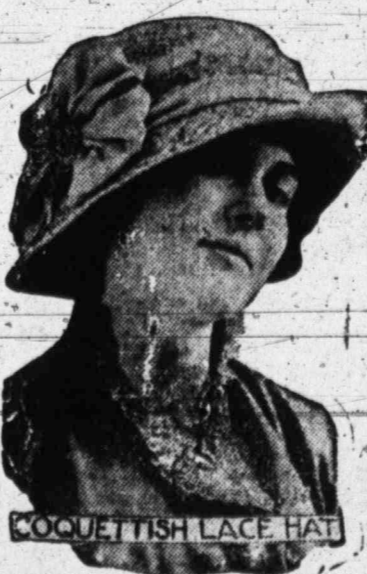
COQUETTISH LACE HAT