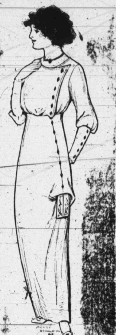
Here is a very pretty frock of tan, linen, trimmed with diamond-shaped pearl buttons. The yoke is of white net and finished by a narrow tie of blue velvet to match the buttons. The sleeves are puffed below the elbows to fitted forearm so long. Two embroidered tabs are placed below the drapery on the left side of the skirt.

50 cents at Taylor's confectionary; 63 cts.