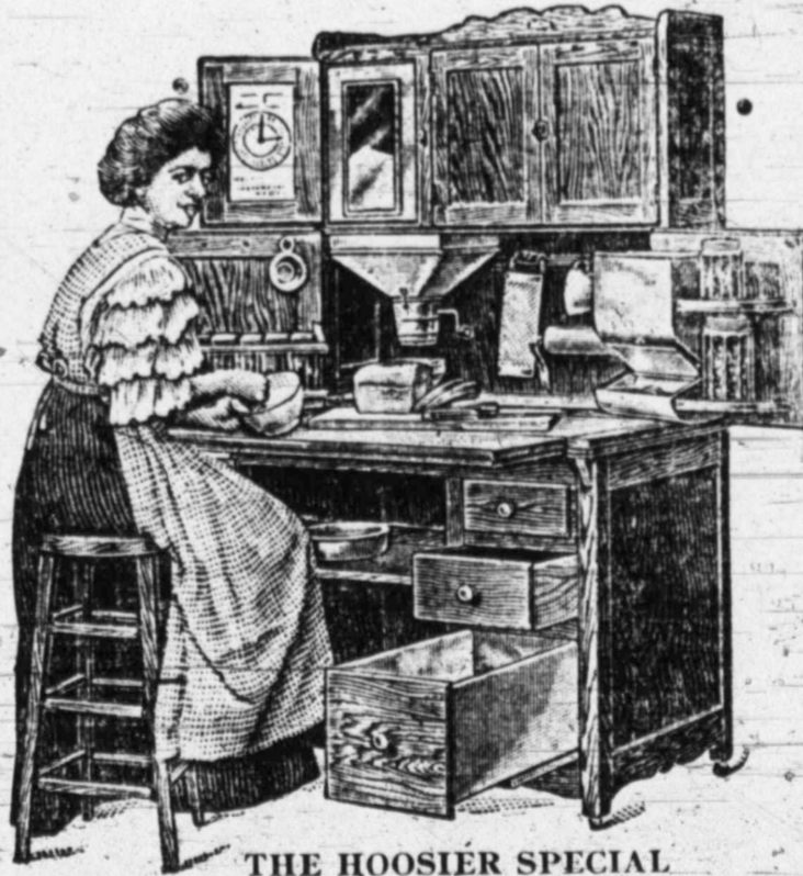
THE HOOSIER SPECIAL Saves Miles of Steps for Tired Feet