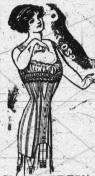
HENDERSON Fashion Form Corsets

The accepted styles for this season require a slender, tubular figure effect. The new models are based upon the attractive and graceful Grecian and Empire vogues. You cannot produce this effect unless you wear the right corset.