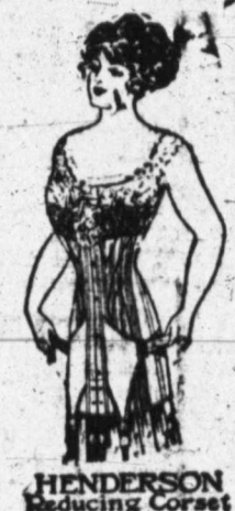
HENDERSON Reducing Corset

It has been convincingly demonstrated that the only hygienic method of anatomically displacing and reducing superfluous flesh is by means of the Henderson Reducing Corsets . This corset, which has been specially designed for large women, is patterned upon scientific principles that will enable the wearer to reduce and modify her figure to fashionable, pleasing lines. We can fit you accurately in a Henderson Reducing Corset that has been individually designed to reduce your figure to harmonious proportions. This corset has attached reducing appliances that enables the wearer to make reductions up to five inches. This is done while the corset is on the figure which is the only hygienic method of reduction. These adjustments are made gradually until this desired reduction is obtained. The appliances release instantly when given a reverse pull.