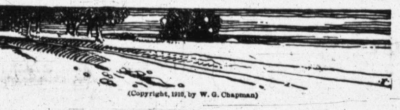
(Copyright, 1911, by W. G. Chapman)

Dews that gemmed the olden rose, Wayward whispers of the wind, Olden suns and olden snows Of the days we left behind Blend into a wondrous view When we face the coming night— Blend in glories we once knew— In the evening there is light.