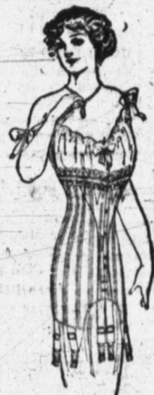
HENDERSON Fashion Form Corsets

Henderson Corsets are individualized for every shape of figure; no matter if you are large, average or slender; tall, medium or small, we have a specially designed, serviceable Henderson Corset that will mould your figure as you individually require. The present season's natural, slender modes necessitate an accurately fitting model if you wish to gain the proper contour. The lasting, satisfactory service these models afford and the moderate prices that we quote are added reasons why you should wear these corsets.