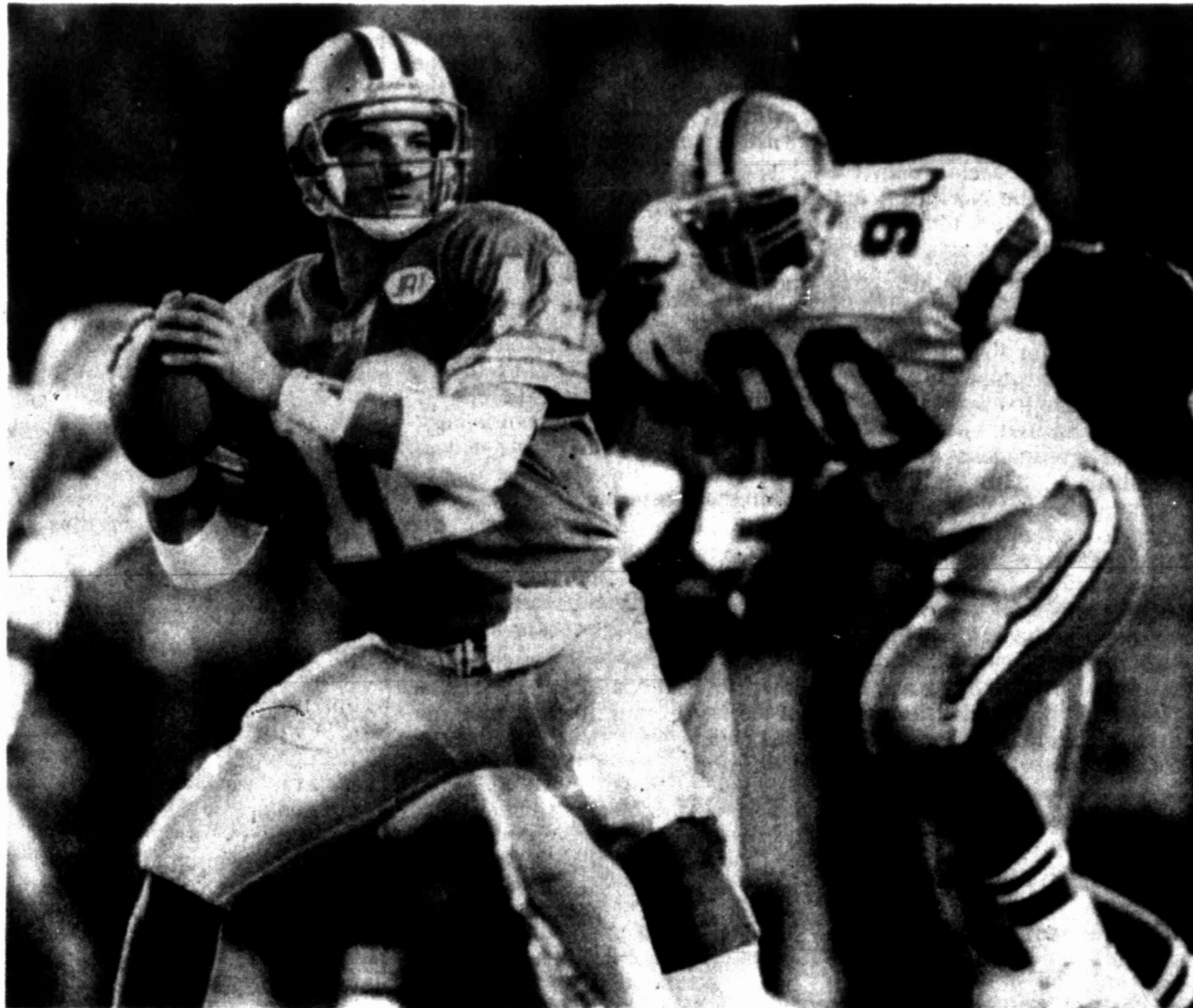
Detroit Lions' quarterback Erik Kramer (12) prepares to pass for part of his 341 yards as Dallas Cowboys defensive end Tony Hill moves in Sunday in Detroit.

PONTIAC, Mich. (AP) — Suddenly it's fun to be Erik Kramer. And why not? All he's done is deliver the Detroit Lions from nowhere to the doorstep of NFL respectability.