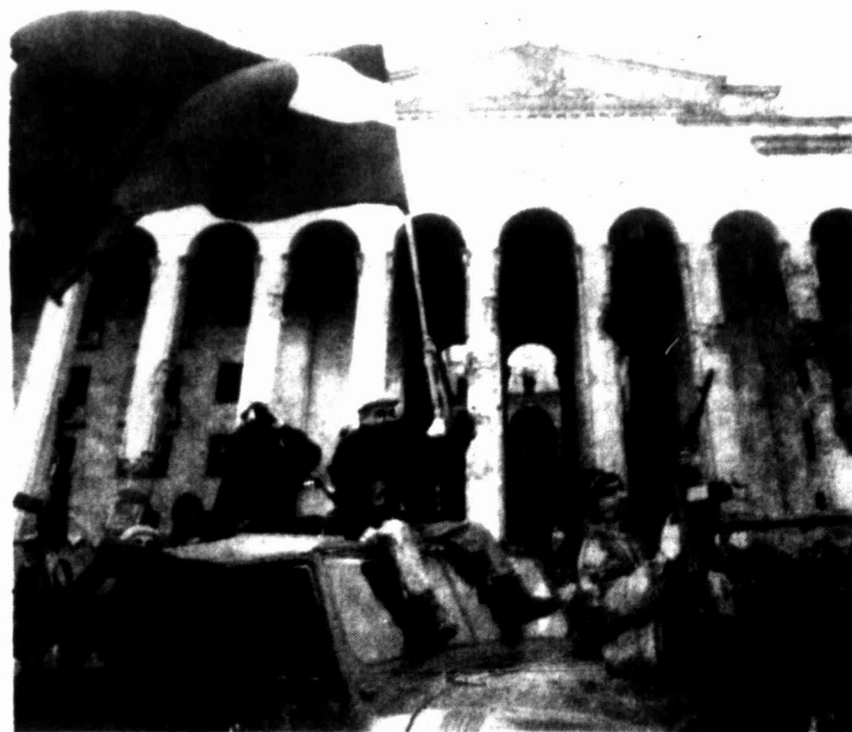
Opposition gunmen shoot into the air as they celebrate taking over the Parliament building (at rear) in Tbilisi today. Georgian President Zviad Gamsakhurdia fled the building early today where he had been hiding since Dec. 22 when fighting began.

Foreign Minister Eduard Shevardnadze. Gamsakhurdia had often criticized Shevardnadze, a Georgian whom some have mentioned as a possible successor to Gamsakhurdia. • Said the military council would seek to bring Gamsakhurdia back for a possible trial. He was believed to be in neighboring Azerbaijan. • Said any move to join the Commonwealth of Independent States would have to await establishment of a civilian government. Georgia and the three Baltic states are the only former Soviet republics that have not joined the new commonwealth. • Dismissed talk of Gamsakhurdia continuing the fight. "No, we are not afraid. He has no support base. There will be no civil war," said Ioseliani.