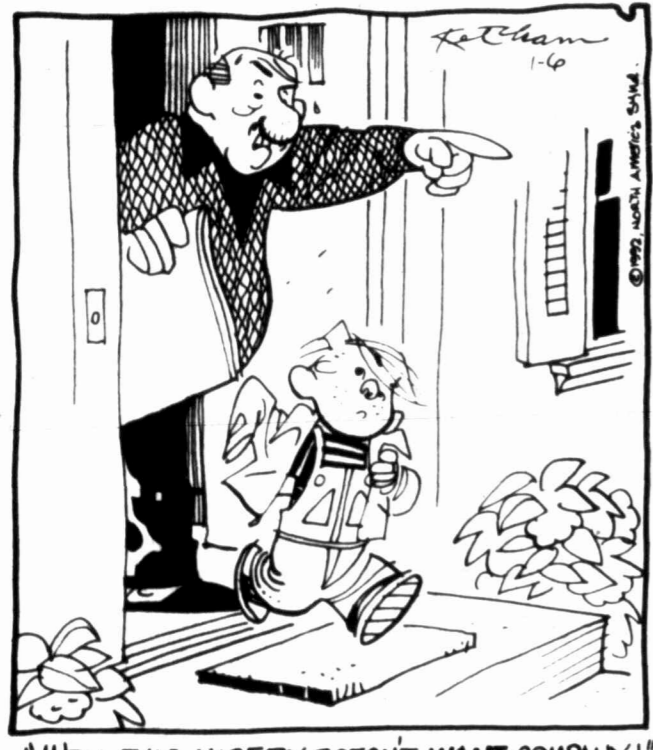
"WELL, THIS MISERY DOESN'T WANT COMPANY!"