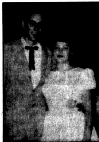
30 years ago