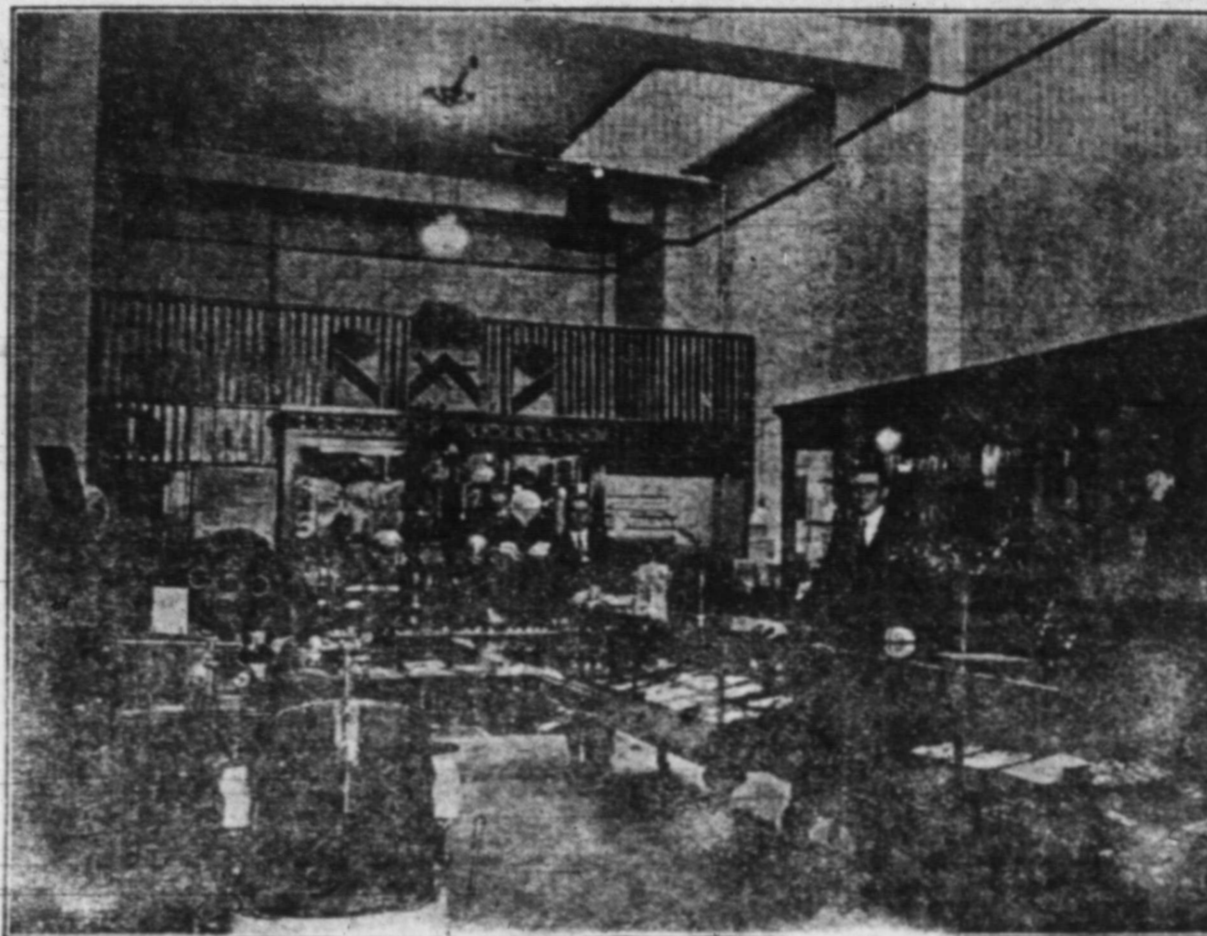
Interior View Anderson Bros. Jewelry Store