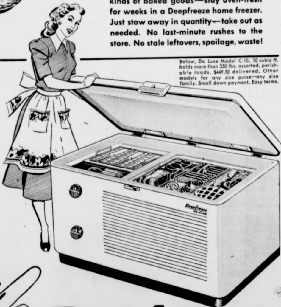
Below, De Luxe Model C-10, 10 cubic ft. holds more than 350 lbs. assorted, perishable foods. $449.50 delivered. Other models for any size purse—any size family. Small down payment. Easy terms.