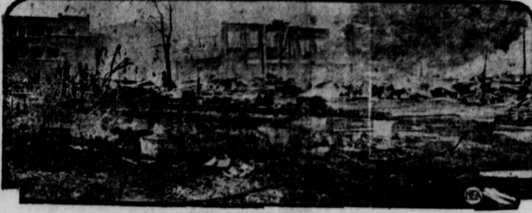
Fifty-two buildings were destroyed when fire swept the newly-born oil town of Liberty, Texas. The buildings burned included the railway stations, both hotels and more than two dozen business structures. Damage was estimated at $200,000.