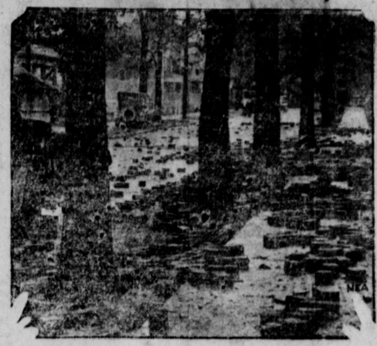
They had a heavy rain in Detroit-elmost a cloudburst-and it flooded dozens of streets. Streets that were paved with wood or composition blocks suffered heavily as the blocks floated away

Demands the Enforcement of Anti-Evolution Law be Enjoined