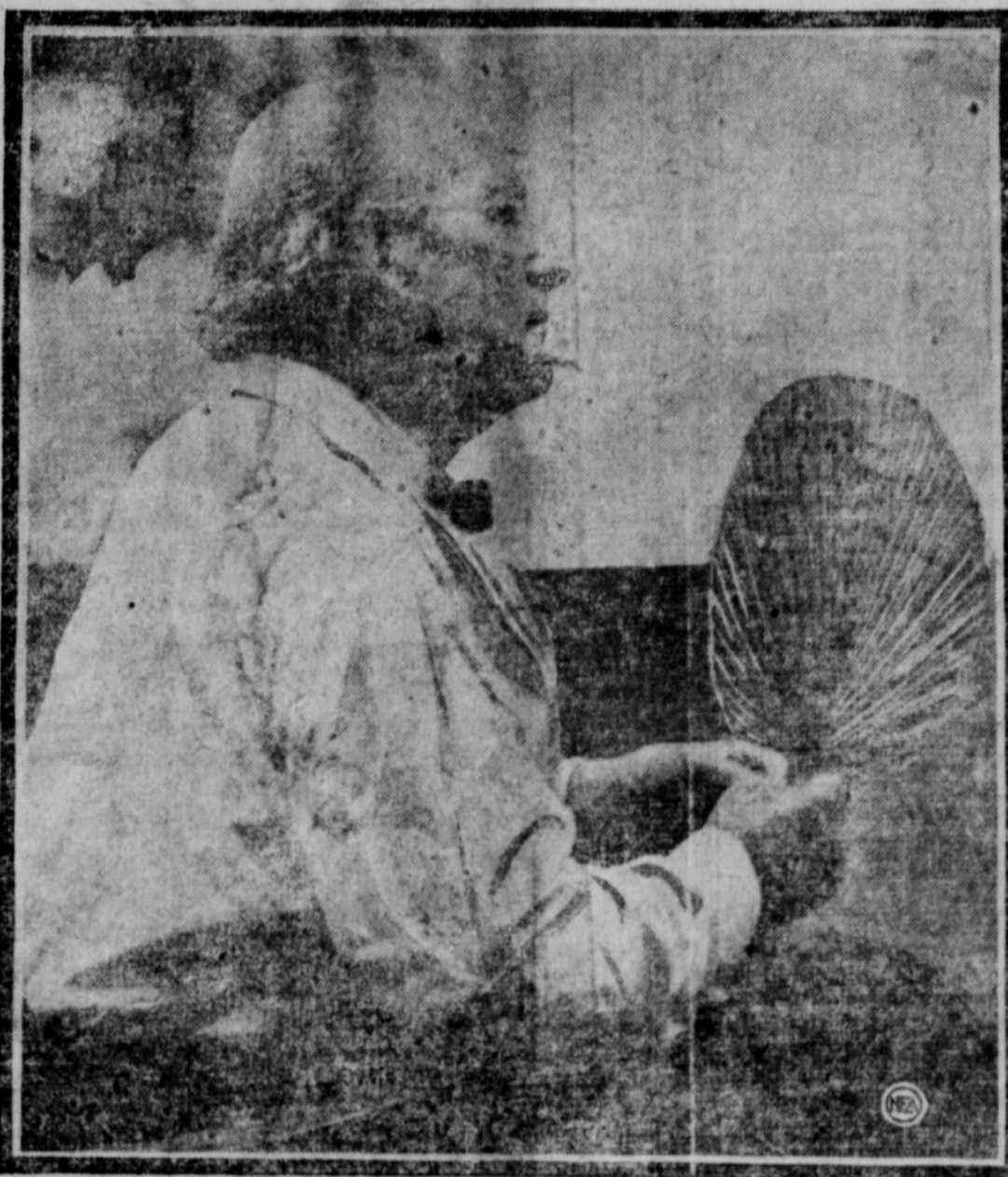
This is one of the last photographs ever taken of William Jennings Bryan. It was snapped by an NEA Service cameraman at the Scopes trial while Bryan was on the witness stand, under examination by Clarence Darrow, counsel for Scopes.