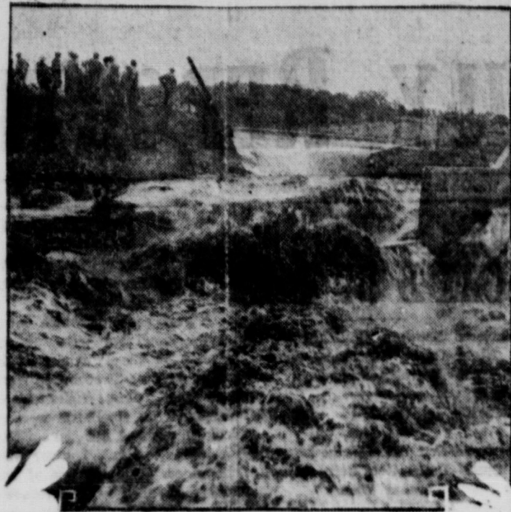
The dam that held the water supply for the town of Horton, Kan., collapsed after a series of heavy rains and every able-bodied citizen worked for hours to prevent the flooding of the town and destruction of crops. The lake that was released by the dam's collapse was two miles long, half a mile wide and 35 feet deep.

the gubernatorial honors, undismayed at the previous reception accorded him. Friends of Speaker of the House Satterwhite of Panhandle and Eugene Blount of Nacogdoches are urging them to make the race as well. This political Damon and Pythias, who controlled the legislature during the recent very successful session will, of course, not run in opposition to one another. That is if one runs, the other will not.