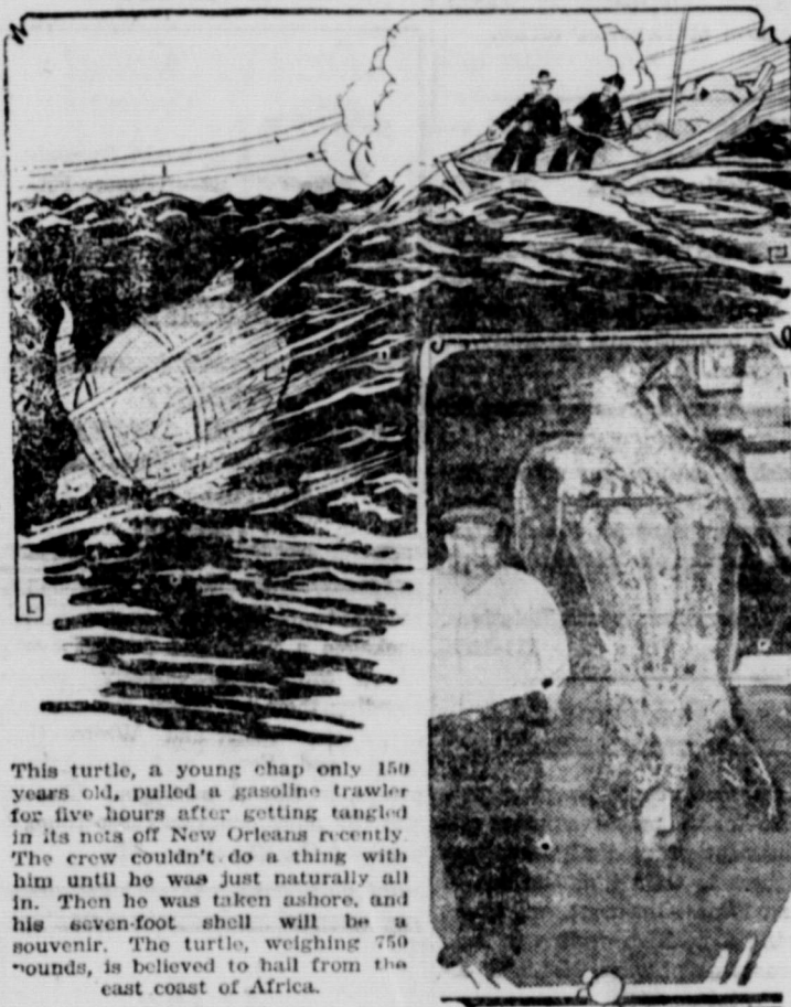
This turtle, a young chap only 150 years old, pulled a gasoline trailer for five hours after getting tangled in its nets off New Orleans recently. The crew couldn't do a thing with him until he was just naturally all in. Then he was taken ashore, and his seven-foot shell will be a souvenir. The turtle, weighing 750 pounds, is believed to hail from the east coast of Africa.