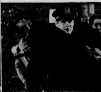
BEING PROM. The FEARLESS LOVER