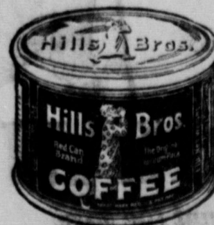
In the original Vacuum Pack which keeps the coffee fresh.