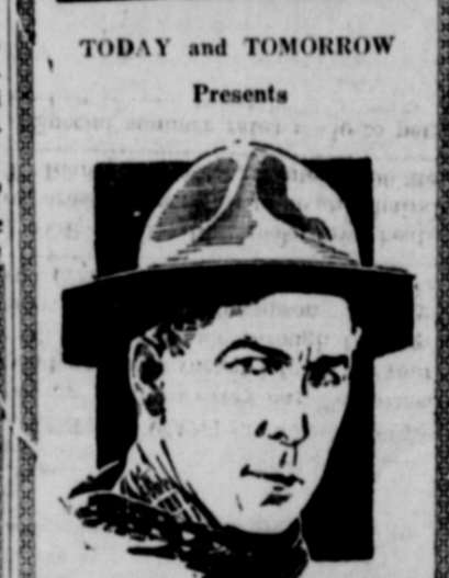
William S. Hart in the Paramount Picture