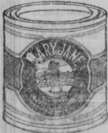
Mary Jane Cans are honest weight—contain full weight as label indicates.

MARY Jane Syrup is a deliciously wholesome sweet for young people. Parents realize that its large percentage of rich, energizing food elements means health and strength to their family. Get a can from your grocer and be sure that Mary Jane's picture is in the circle.