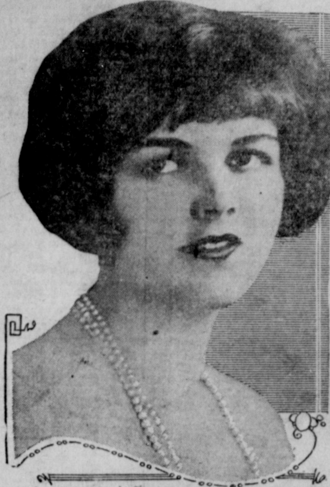
Flo Ziegfeld is one of the latest finds of Flo Ziegfeld, connoisseur feminine beauty. She is now one of the features of the Folies.