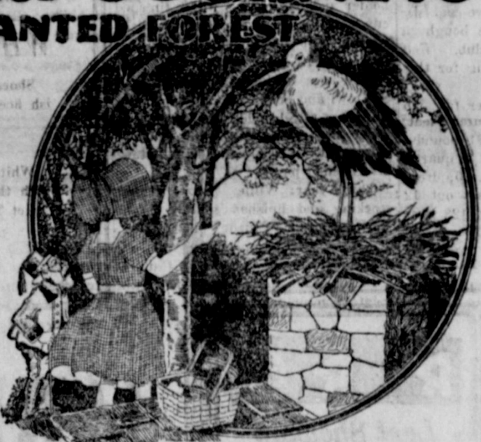
"You have grown to be quite a little girl," said the Stork, "Do you remember me?"

Mary Jane Discovers the Ciconia is the Bird of Good Luck