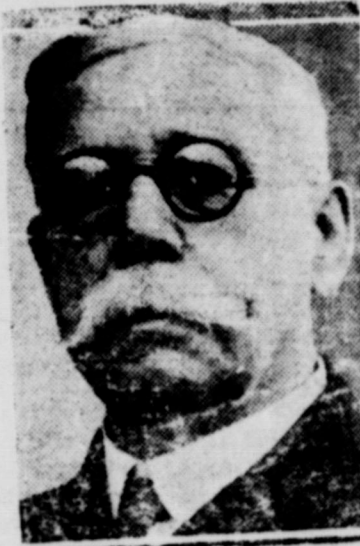
Senator Watson of Wyoming, who has had the longest service in the Senate, may become majority spokesman because of the rivalry between Senator Wadsworth of New York and Senator Curtis of Kansas.

cut into a beautiful bob the other day. As far as tonsorial history goes she is about the youngest patron of Sweetwater barber shops known.